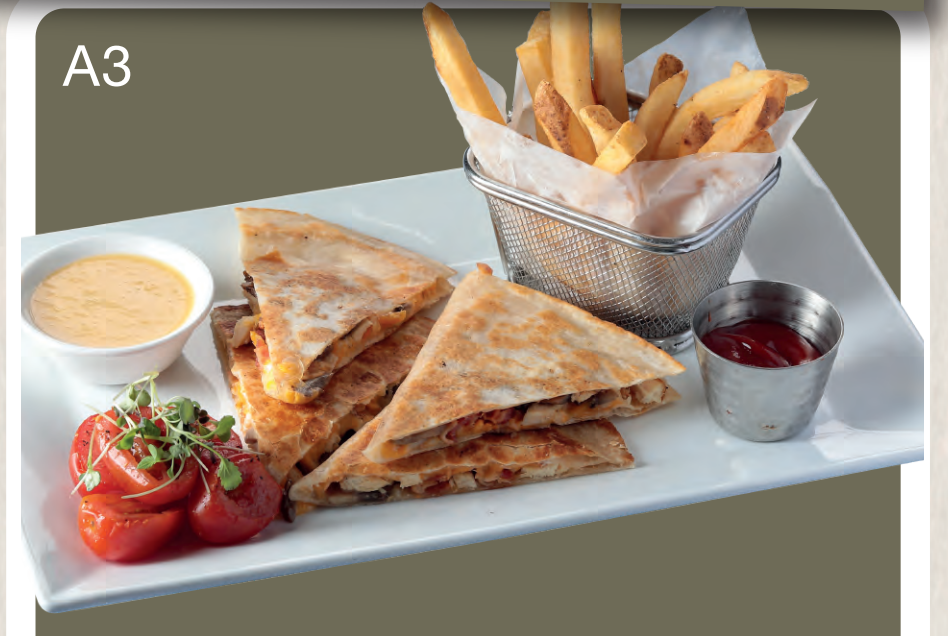
A3 CHICKEN QUESADILLA 燒雞肉芝士夾餅 $118 $78