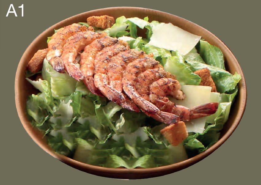
A1 GRILLED SHRIMP CAESAR SALAD 燒蝦凱撒沙律 $138 $68