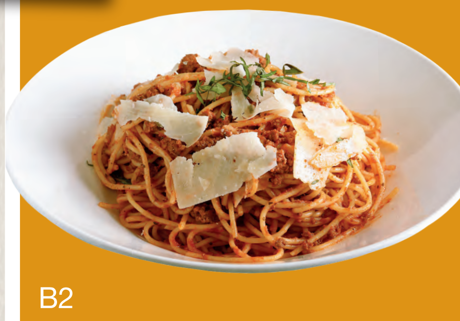
B2 STEAKHOUSE PASTA 蕃茄肉醬意粉 $118 $68