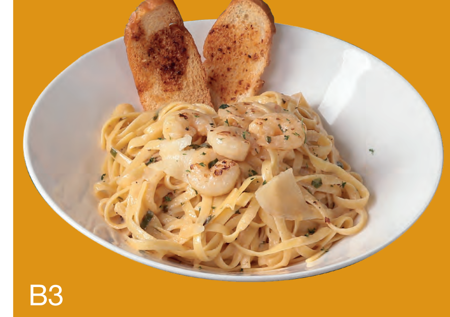
B3 TOOWOOMBA PASTA 芝士白汁燒蝦寬麵 $148 $88