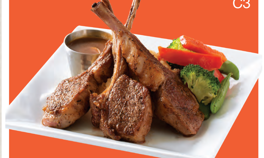
C3 AUSTRALIA LAMB CHOPS 燒澳洲羊扒 $208 $168