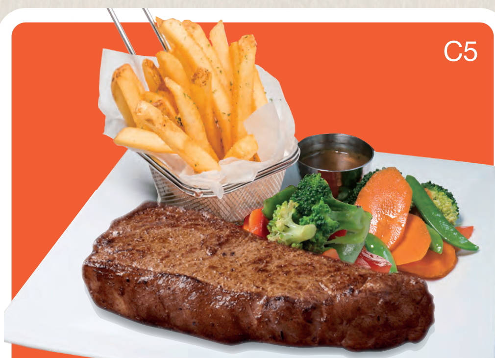
C5 AUSTRALIAN MB4-5 WAGYU STRIPLIN (10 oz) 澳洲MB4-5和牛西冷牛扒 $248 $198