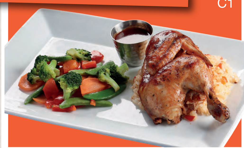
C1 ROASTED BBQ HALF CHICKEN 燒肉醬味烤雞 $168 $98