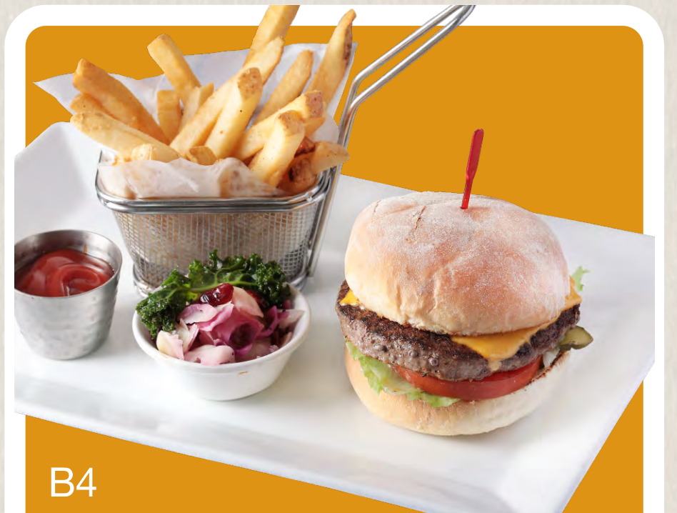
B4 THE OUTBACK CHEESEBURGER 澳坊芝士漢堡 $108 $68