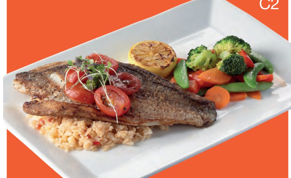
C2 SIMPLY GRILLED BARRAMUNDI 燒盲槽魚柳 $188 $98