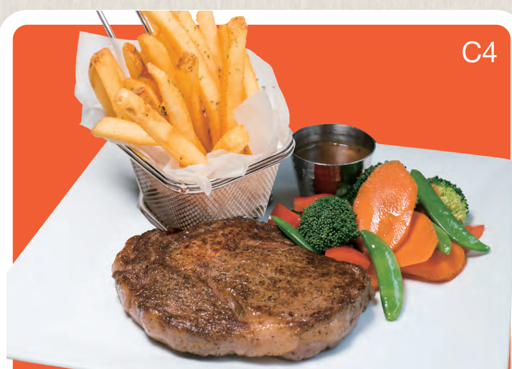
C4 USDA RIBEYE STEAK (10 oz) 美國精選肉眼牛扒 $248 $188