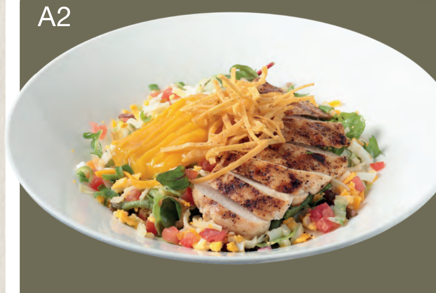
A2 MANGO CHICKEN SALAD 香芒燒雞肉沙律 $142 $78