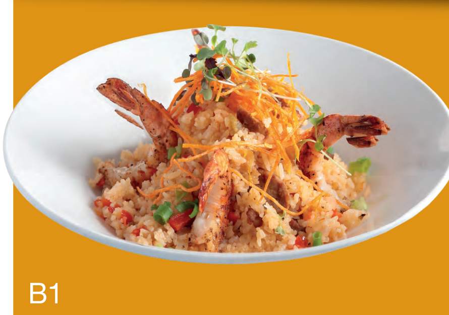
B1 SPICY SHRIMP RICE 香辣燒蝦飯 $118 $58